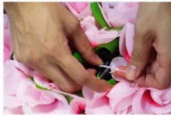
Step 3: Recommended reinforcement with zip ties