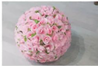
Step 2: Merge